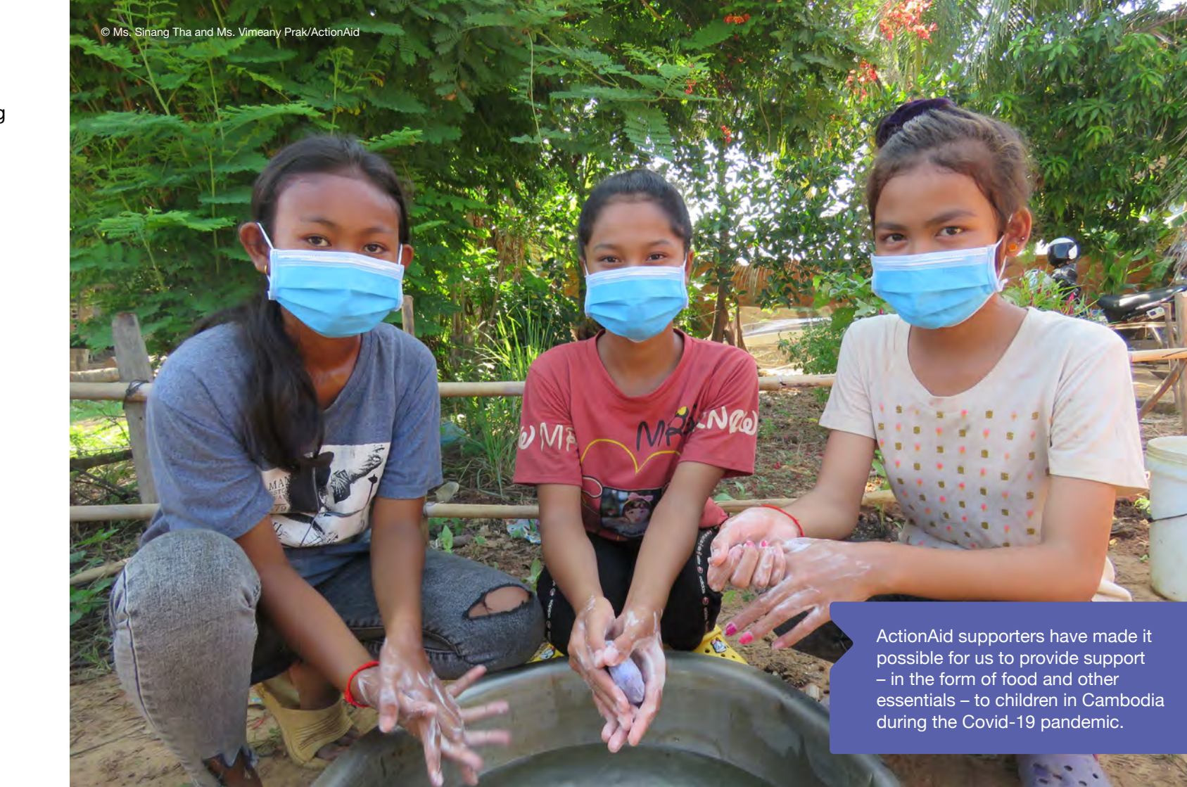
CEO ActionAid UK