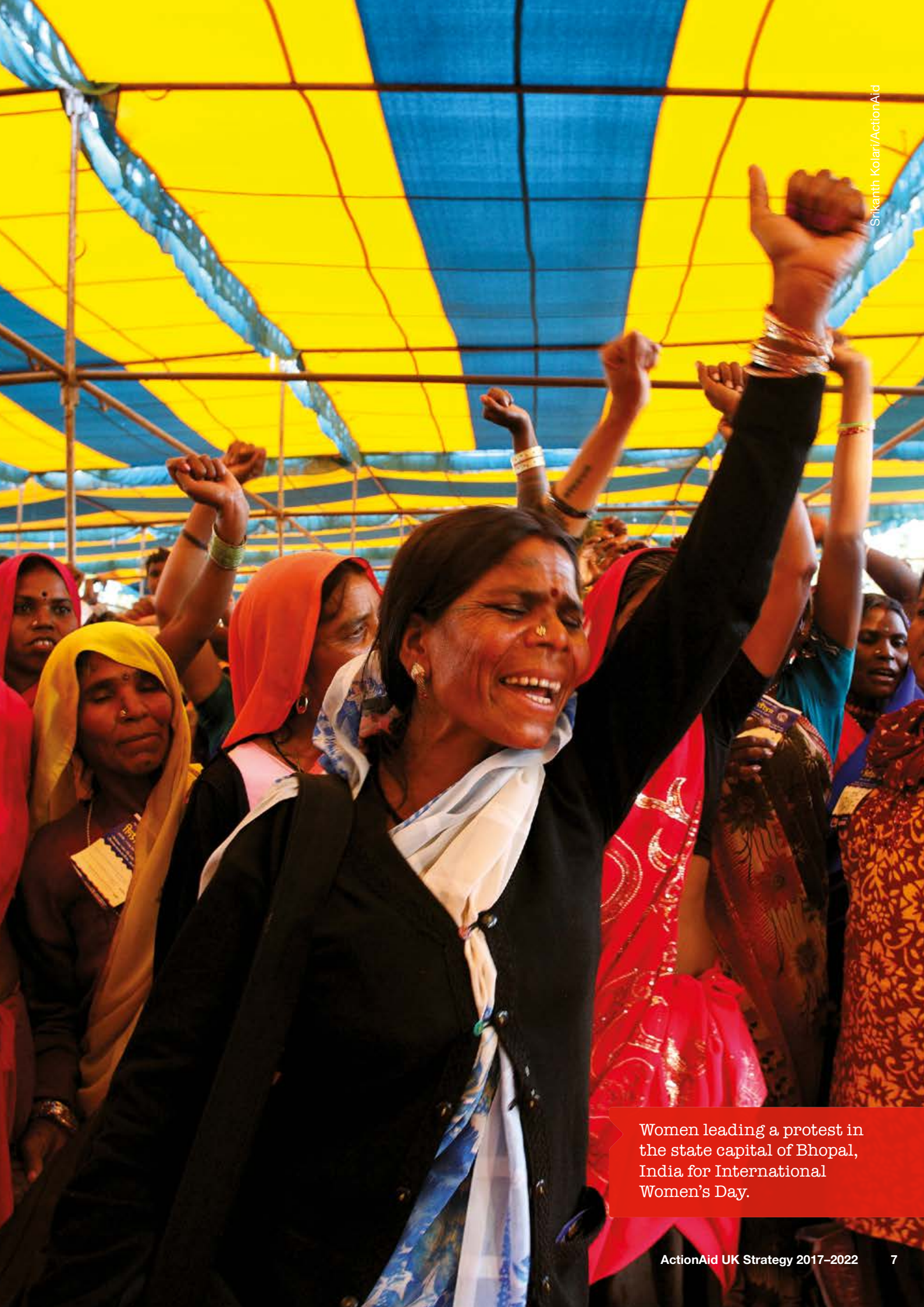
Women leading a protest in the state capital of Bhopal, India for International Women's Day.